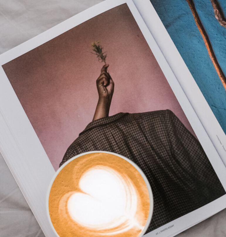
45 | PHOTO ESSAY