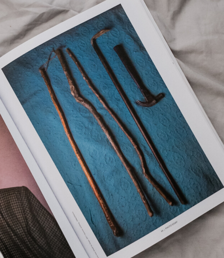
46 | PHOTO ESSAY